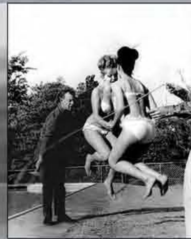
Jumping girls from Schadeberg's South Africa in the 1950s photos.