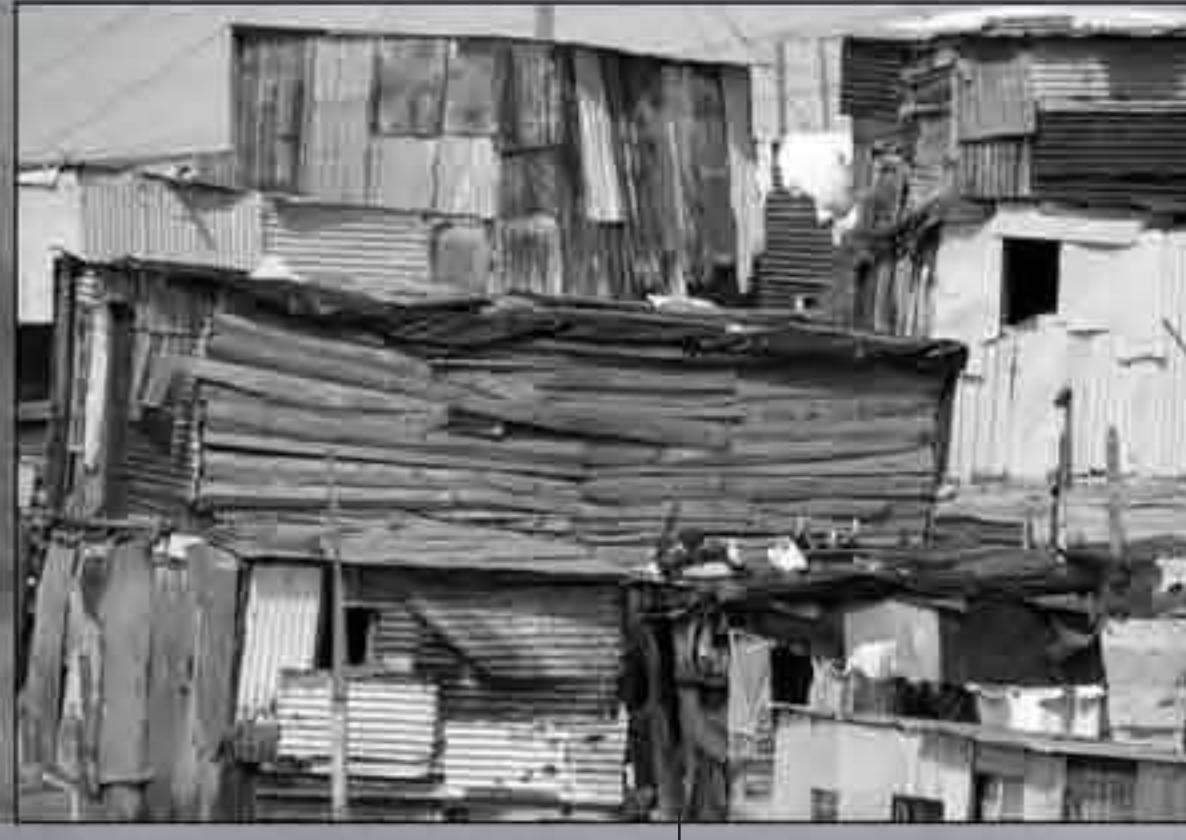
Khayelitsha Cape Town Township, circa 2006. ( www.capetown.dj )