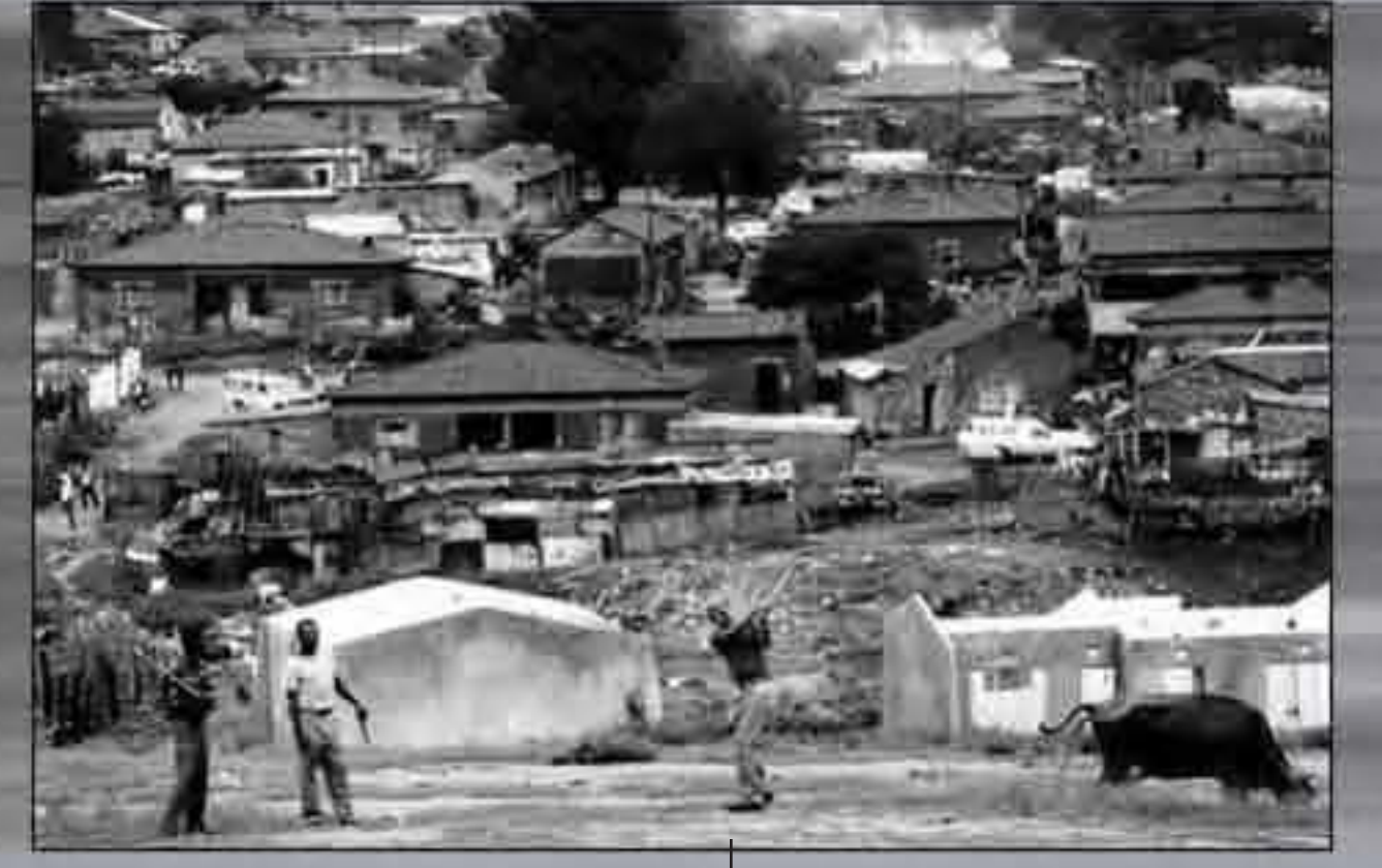
On a Sunday afternoon, golfers practice on a dirt field overlooking Alexandra Township on February 23, 1986.