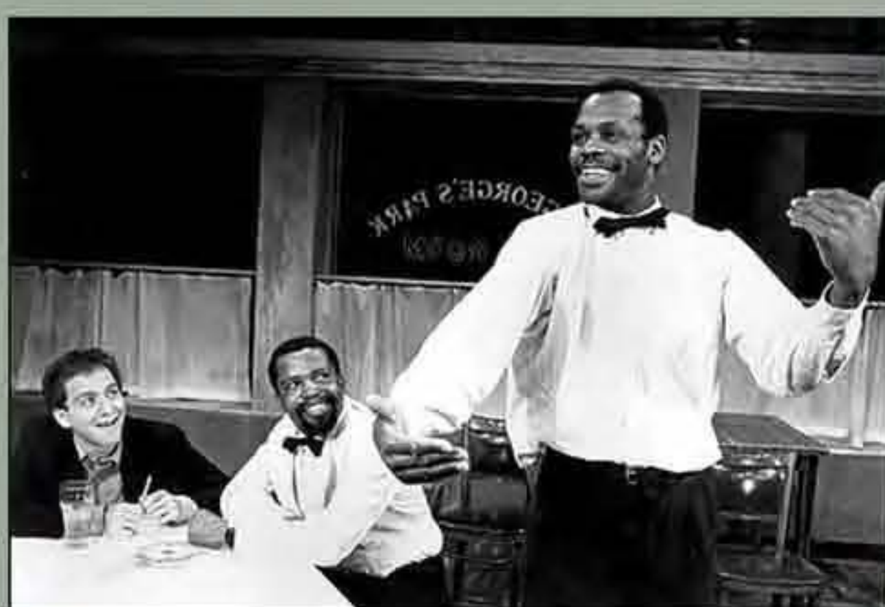
Zakes Mokae (center) with Lonny Price (left) and Danny Glover in the Broadway premiere of 'Master Harold'... and the Boys, 1983.

The play moved to Broadway's Lyceum Theatre in May 1982, again with Fugard as the director, Mokae as Sam and Glover as Willie. Lonny Price played Hally.