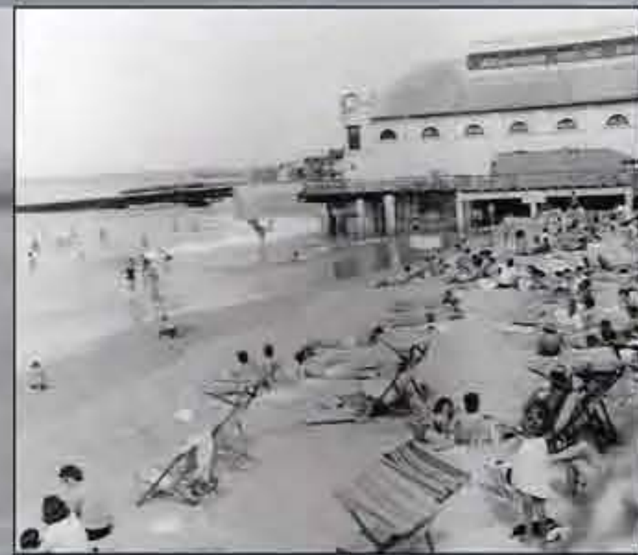
Humewood Beach, Port Elizabeth, South Africa, circa 1957.