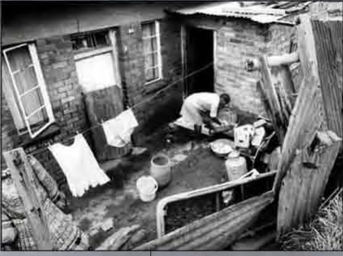
A woman launders clothes by hand outside her brick and tin home in Alexandra on January 24, 1986.