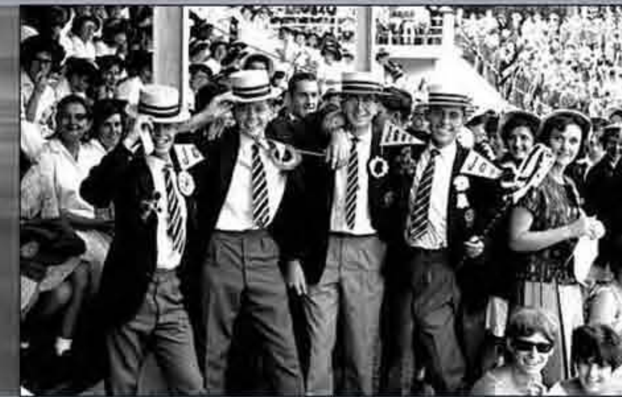
KES (King Edward's VII School) schoolboys in Johannesburg, circa 1958.