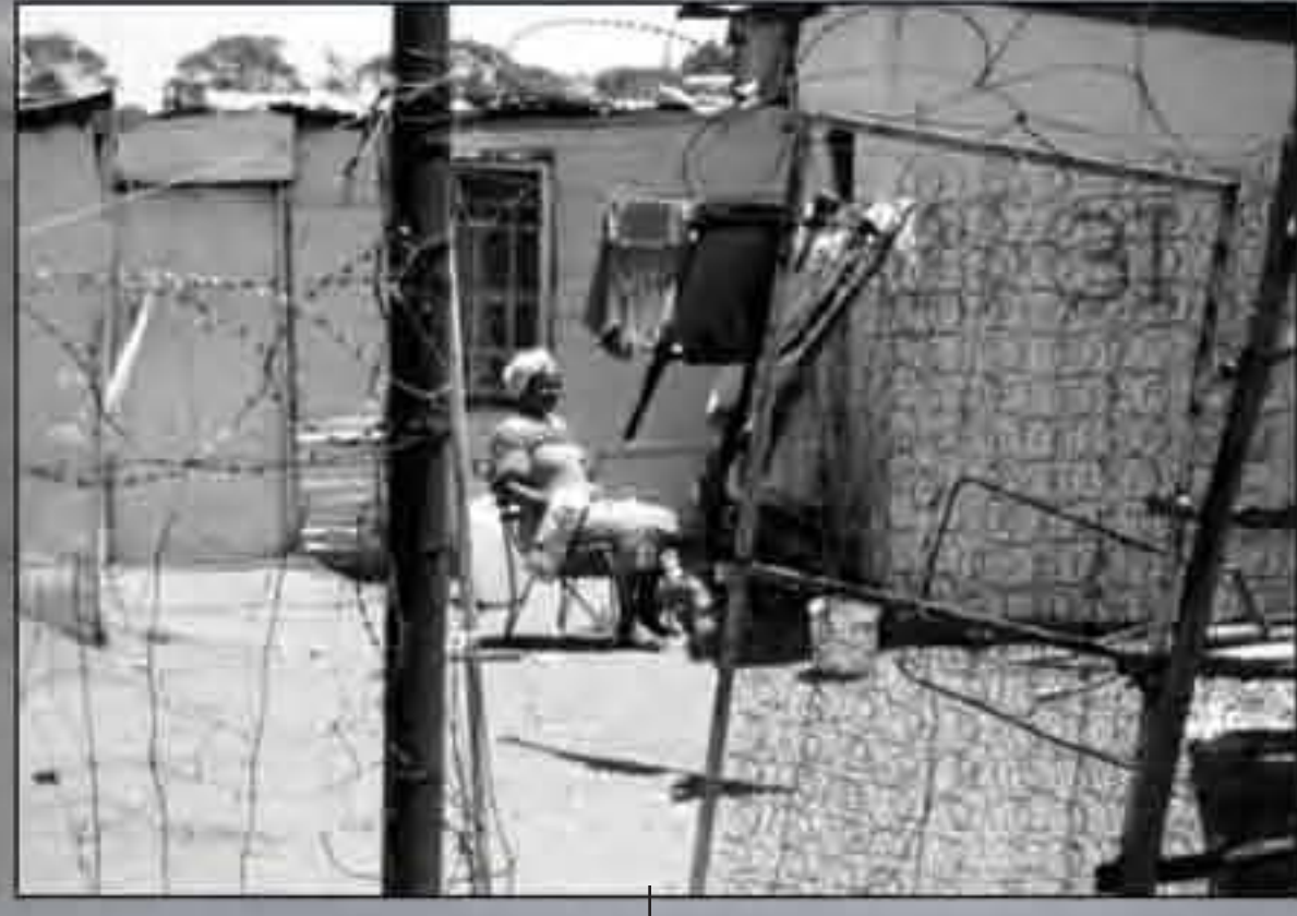
Soweto housing camp, Johannesburg, circa 2002.